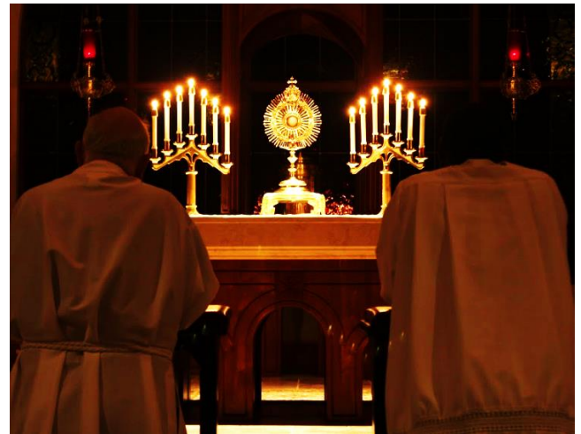
Adoration at Holy Apostles College & Seminary