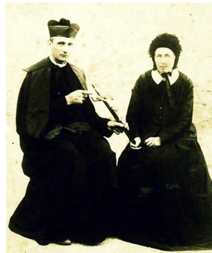
St. Hannibal and Melanie Calvat

canonization homily, St. John Paul II said that St. Hannibal had a "...love for the Lord [that] moved him to dedicate his entire life to the spiritual well-being of others." 2 What you unfortunately will not see in any popular